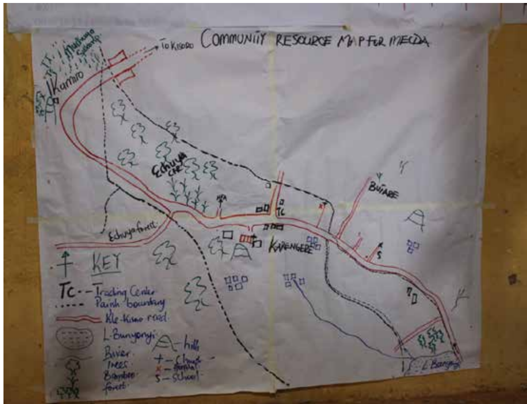
Figure 1: Community resource map generated by Muko community members