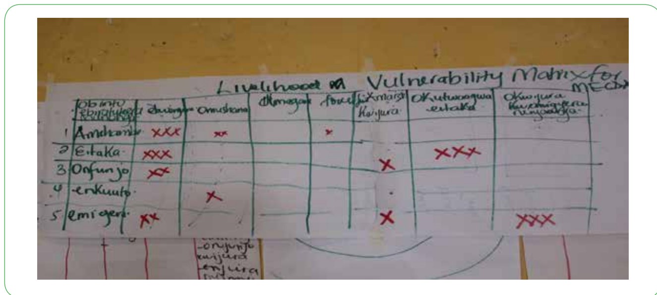
Table 4: Livelihood Vulnerability and trends in the Impact