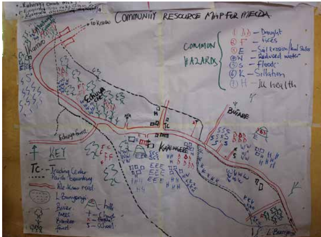
Figure 3: Community map showing the location of hazards

The hazards were added to the resource map earlier developed. The hazards were put on the map as using symbols as seen below.