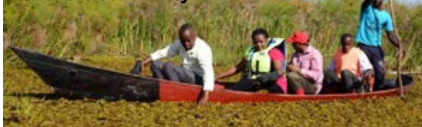
BELOW: Members also cleaned up an invasive weed on the River Lugogo in Nakasongola together with the community