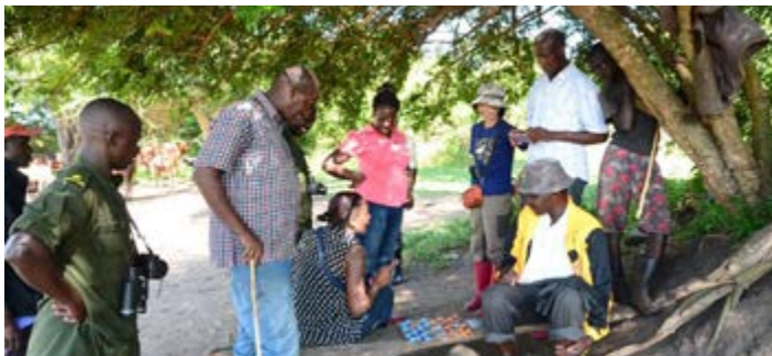
ABOVE: NatureUganda Members who visited Ziwa Rhino in Nakasongola District take time off to play a game of omweso with some community members.