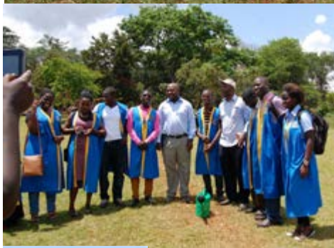
NatureUganda members, the school and UMEME staff planting trees at Salaama Sch for the Blind