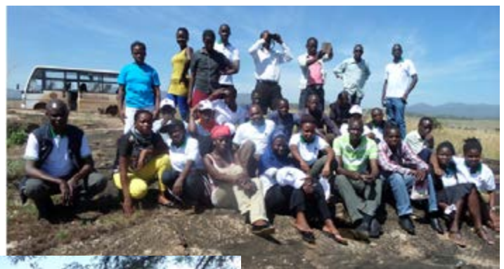
ABOVE: NatureUganda Busitema Branch members visited Kidepo National Park, Kaabong in September. During their visit, they were entertained by a community that lives around the park (LEFT)