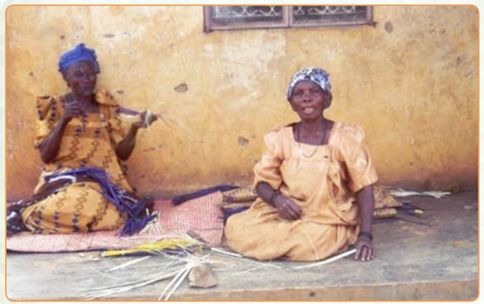
Women making mats from palm leaves for sale, one of the ways they can get livelihoods outside fishing and tour guiding

Sustainable resource utilization and conservation boosted by Local Community Empowerment Programme (LEP)