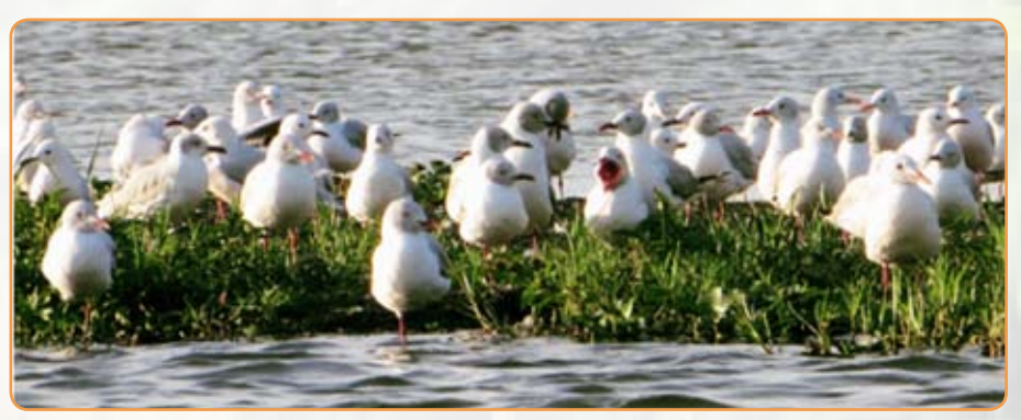
Grey-headed Gulls on Lutembe bay. Such bird congregations are a big tourism attraction for the site

By Dianah Ualwanga Wabwire Research & Monitoring Coordinator